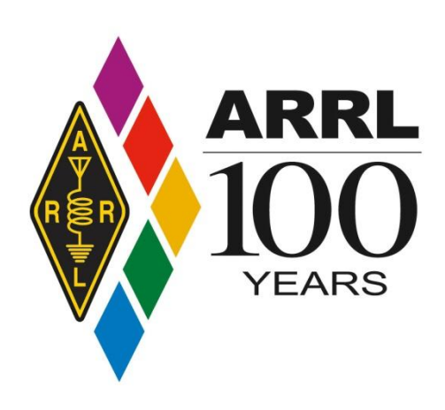
Hiram Percy Maxim, W1AW